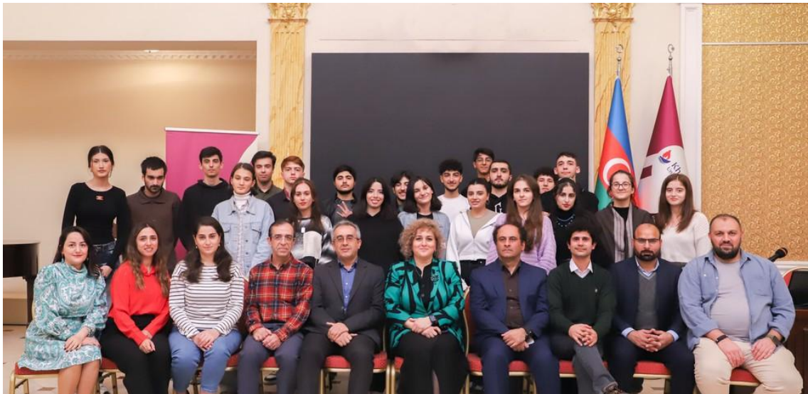
("Hot Topics in Artificial Intelligence Applications" Workshop - NEWS-Khazar University)

From October 22-24, Khazar University hosted a dynamic three-day workshop titled "Hot Topics in Artificial Intelligence Applications." Organized by the university's Intelligence Systems Research Center (ISRC), the workshop brought together esteemed teaching staff, industry experts, and students eager to explore the latest trends, challenges, and innovations in artificial intelligence (AI).