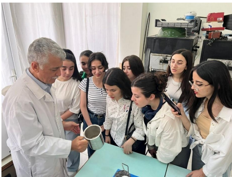
Students at Genetic Resources Institute of the Ministry of Science and Education - NEWS-Khazar University

From May 17-24, 2024, second-year Biology Education students from Khazar University's School of Science and Engineering visited the Genetic Resources Institute (GRI) of the Ministry of Science and Education of the Azerbaijan Republic.