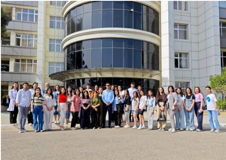
Psychology Students Engage with the Elderly - NEWS-Khazar University

On May 31, 2024, at the initiative of Khazar University's Department of Psychology, students majoring in psychology visited the Social Services Agency for the Elderly under the Ministry of Labor and Social Protection of the Population.