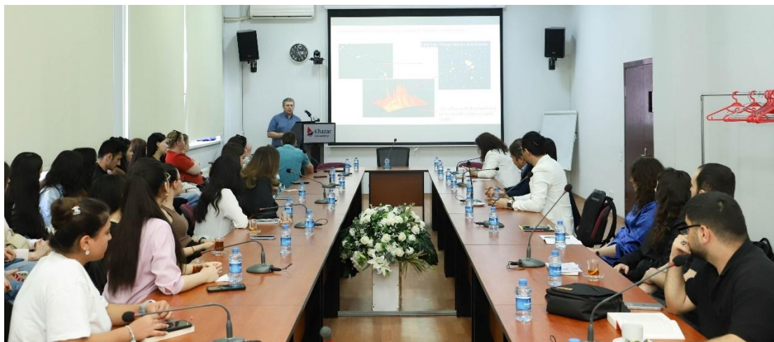
(Delegation of the Joint Institute for Nuclear Research located at Dubna(Russia) at Khazar University - NEWS-Khazar University)

From April 29 to May 3, 2024, a series of lectures on "Modern Nuclear Physics and Its Applications" were held by the delegation of Dubna's Joint Institute for Nuclear Research (JINR) at Khazar University. Faculty members, undergraduate and graduate students and doctoral students of Khazar University's School of Sciences and Engineering, along with guests from other organizations and universities, were invited to listen to the lectures. The lectures continued for 5 days in the form of discussions and garnered great interest.