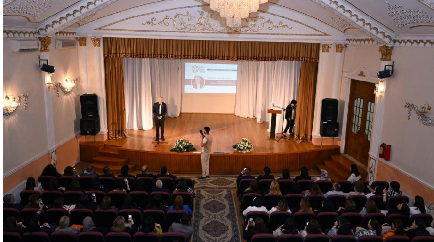
(First National Education Summit Held - NEWS-Khazar University)

the Republic of Azerbaijan, "Educational Future" Education Development Public Union and Khazar University. About 250 representatives of the educational community attended the summit.