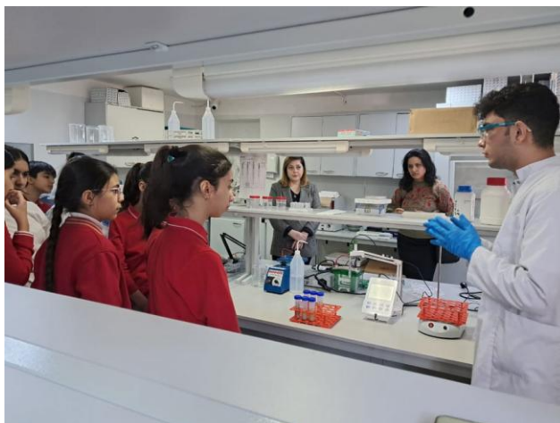
(Students of Sumgayit "Dunya" school at Khazar University - NEWS-Khazar University)

From April 29 to May 3, 2024, a series of lectures on "Modern Nuclear Physics and Its Applications" were held by the delegation of Dubna's Joint Institute for Nuclear Research (JINR) at Khazar University. Faculty members, undergraduate and graduate students and doctoral students of Khazar University's School of Sciences and Engineering, along with guests from other organizations and universities, were invited to listen to the lectures. The lectures continued for 5 days in the form of discussions and garnered great interest.