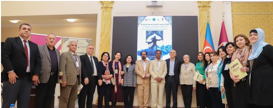
(IX International Rumi Symposium at Khazar University - NEWS-Khazar University)

On December 12-13, 2024, an international scientific conference dedicated to the study of the legacy of the great Eastern philosopher Mevlana Jalaluddin Rumi was held at Khazar University. The scientific symposium, traditionally organized annually by the Rumi Research Center of Near East University of Northern Cyprus on topics of Mevlana, Mevlevi order, Sufism, and wisdom, was held this year at the university in joint organization with Khazar University's Mevlana Literary-Philosophical Research Institute. "Rumi Scientific Symposium" is a prestigious scientific event where valuable scholars and researchers from many countries present competent research on Sufi literature, philosophy, scientific perspectives on the Mevlevi order, mysticism, and wisdom.