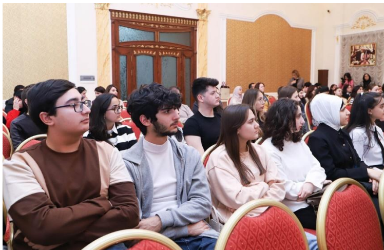
Seminar on "Pathways to Success: Tips for Achieving Your Goals" - NEWS-Khazar University

On February 19, 2024, a seminar on "Pathways to Success: Tips for Achieving Your Goals" was held for university students of Khazar University.